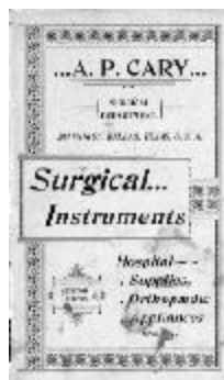
A.P. Carey's Surgical Instruments