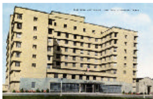
Methodist Hospital 1951 Postcard Collection